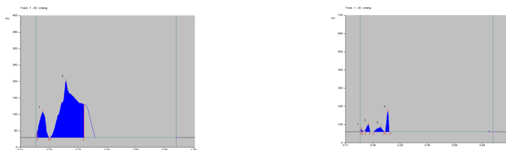
Plate 2: HPTLC study of Vidanga