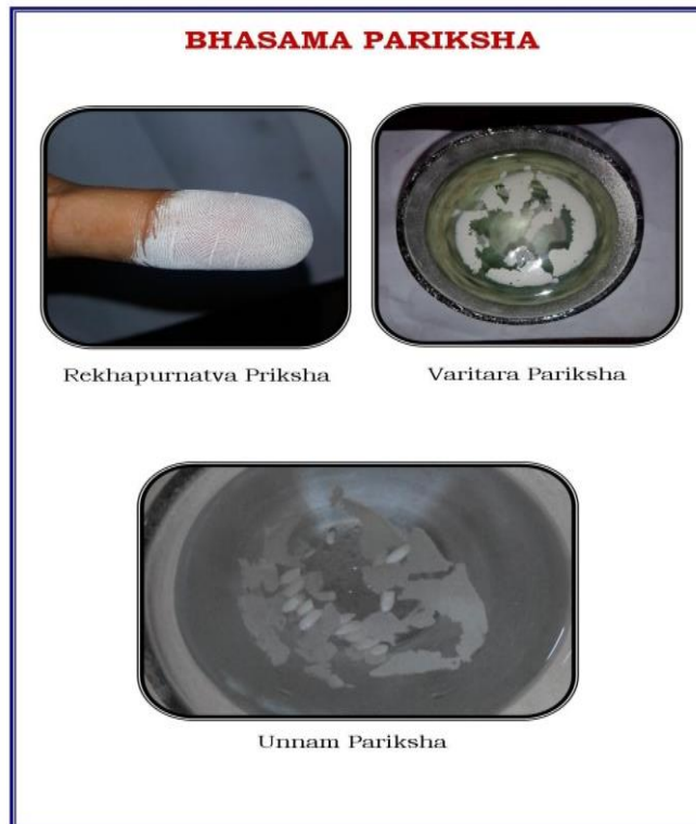
Figure 2: Bhasma pariksha according to classical parameter