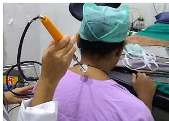
Image 5: Agnikarma demonstration by Temperature Controlling Unit with modified Silver probe

Type 2 Method- After cleaning the site, the temperature is set on 60 degree Celsius, and then with the help of specially designed probe (having multiple silver micro rods fixed on round silver plate resembling brush) the Dagdhavrana rahit Agnikarm (Continuous heat transfer without post burn scar) is performed on most tender site as marked and bindu (dot) type Agnikarma is performed. The shalaka is kept in contact of skin for duration of 10 seconds. This is done only once as the shalaka consist of silver micro rods fixed on round silver plate to obtain desired effect of Dagdhavrana rahit Agnikarm (therapeutic heat transfer without post burn scar).