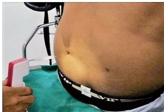
Image 4: Agnikarm demonstration by Electrocautery Unit with modified silver-plated Electrode

Type 1 Method- After cleaning the site, the temperature is set on 1.5 volts (55°C), and then with the help of raupya shalaka (probe attached to handle with red-hot heating coil covered with silver plate cap) the Samyak Dagdha Agnikarma (adequate heat burn with scar) is done intermittently on affected site as marked and thus, bindu (dot) type of Agnikarma is performed. The shalaka (tip of probe) is kept in contact of skin for duration of 1-2 seconds. This is repeated multiple times (10-12 different places) to get desired effect covering affected area.