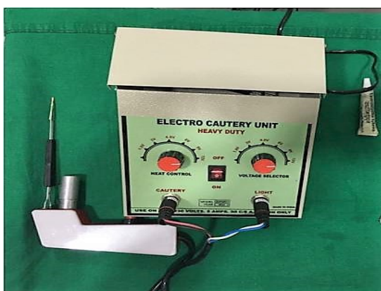
Image 1: Electro-cautery device with modified probe used in Method-1 Agnikarma