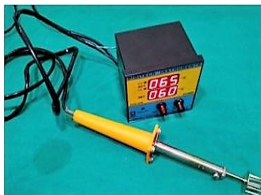
Image 2: Temperature controlling unit with modified probe used in Type-2 Agnikarma