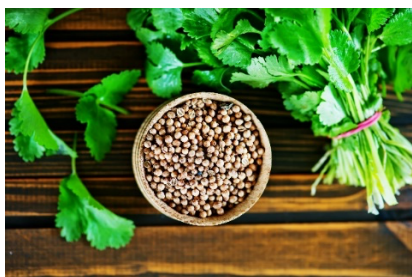
Figure 1: Coriander ( Coriandrum sativum )

light pink, asymmetrical with the petals pointing away from the center. The coriander seed is an ovate globular dry schizocarp with two mericarps 22 .