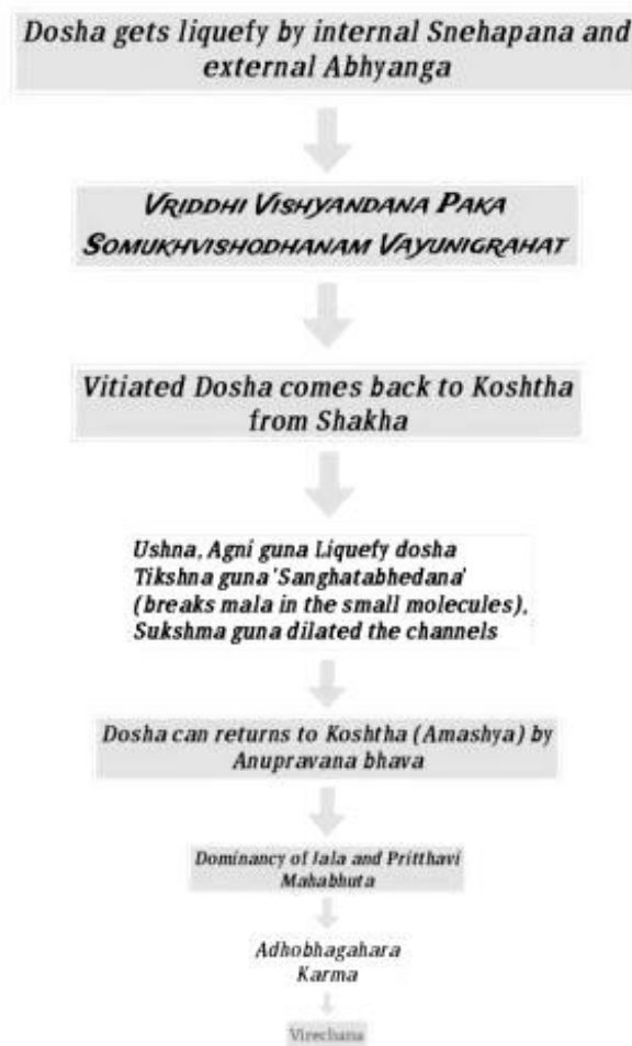
Diagrammatic presentation of Mode of action of Virechana