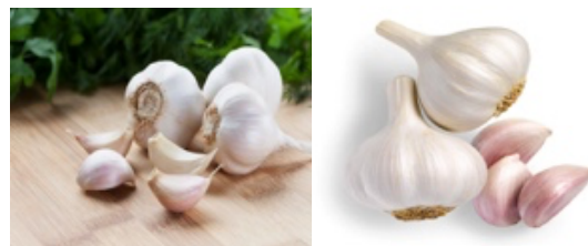
Figure 1: Allium sativum

Homocysteine 11 is a sulfur-containing, non-proteinogenic amino acid that is formed as an intermediate during the metabolism of methionine. Under normal physiological conditions, homocysteine is rapidly metabolized through two major pathways: remethylation and trans-sulfuration. These metabolic processes require folate, vitamin B 12 , and vitamin B 6 as essential cofactors for the proper conversion and clearance of homocysteine. Deficiency of these micronutrients, genetic polymorphisms affecting metabolic enzymes, advancing age, renal dysfunction, and unfavorable dietary patterns may lead to the accumulation of homocysteine in the circulation.