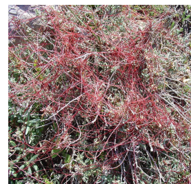
Figure 4: Cuscuta epithymum (L.) L.