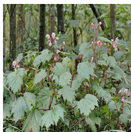
Figure 2: Begonia laciniata Roxb.