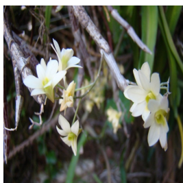
Figure 3: Dendrobium ovatum (L.) Krenzl.