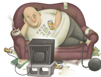
Figure 4: Sedentary lifestyle