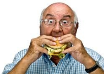
Figure 3: Food causing constipation is better to avoid