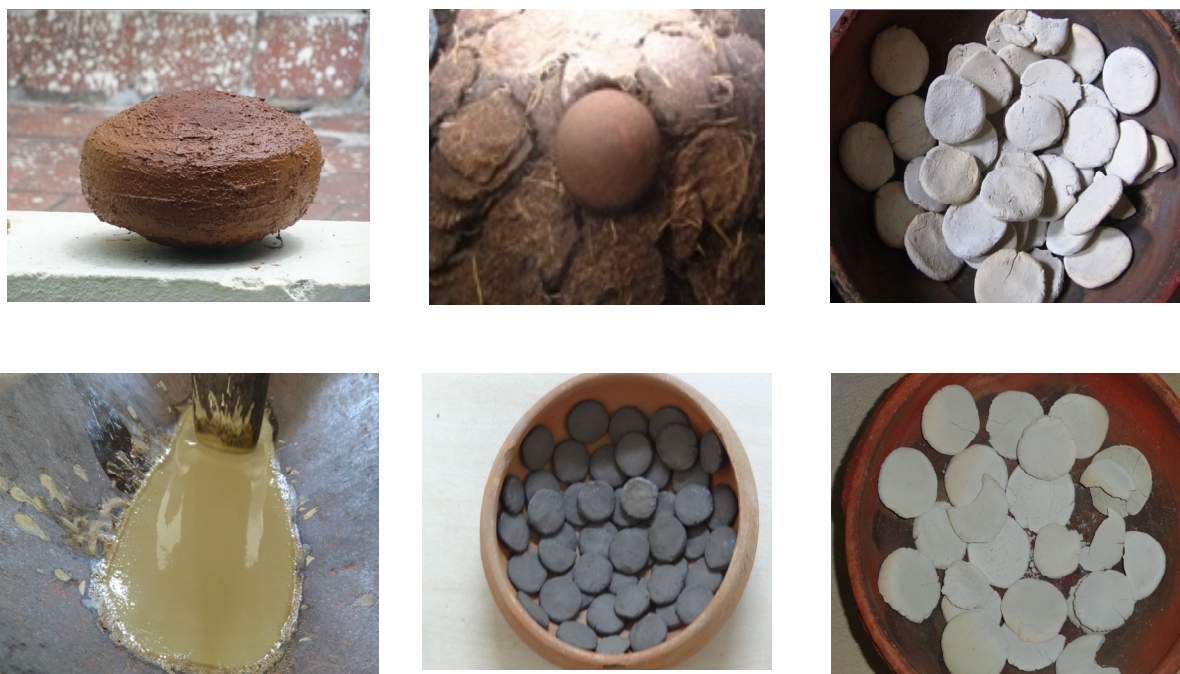
Figure 6: II nd process of putam with Phyllanthus amarus