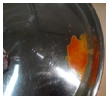
Figure 8: Reaction with turmeric