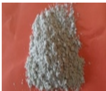
Figure 7: Finished drug (NPC)