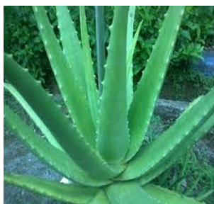
Figure 3: Aloe vera