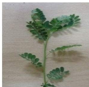
Figure 4: Phyllanthus amarus