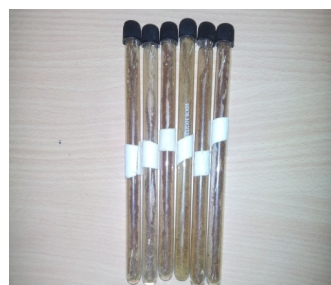
Figure 4: Prepared Kshara Sutra