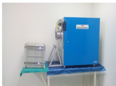
Figure 3: Kshara Sutra Drying oven with hangers and stand