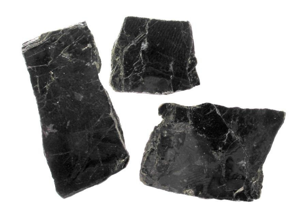
Figure 1: Vajra Abhrak